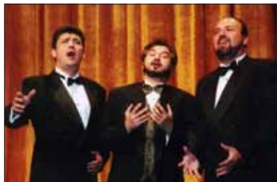
Mexico's Three Tenors

VISTAS DEADLINE IS JULY 10 Have something to submit to the next issue of Pinnacle Vistas? Deadline for the August issue is Sunday, July 10.