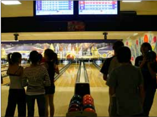
An evening of bowling is in store on Thursday, July 7.

The Newsletter for Pinnacle Presbyterian Church, Scottsdale, Ariz. • June-July 2011