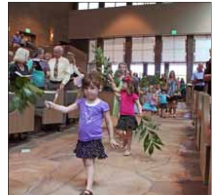
HOLY WEEK From Palm Sunday (above) to the Easter Egg-stravaganza (right) to Easter worship (below), Pinnacle celebrated Holy Week in late April. See more photos from these and other events at pinnaclepres.org .