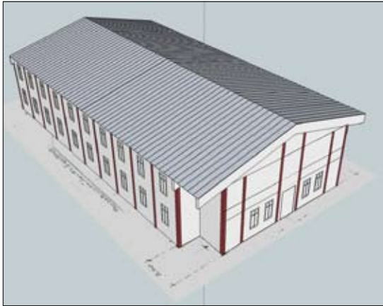
Plans call for the new church to be earthquake and hurricane resistant. Below, ruins of the old church.

Thank you to those who are giving of their time and talents to turn the vision into a plan.