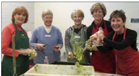
PPC volunteers prepare food at Andre House.