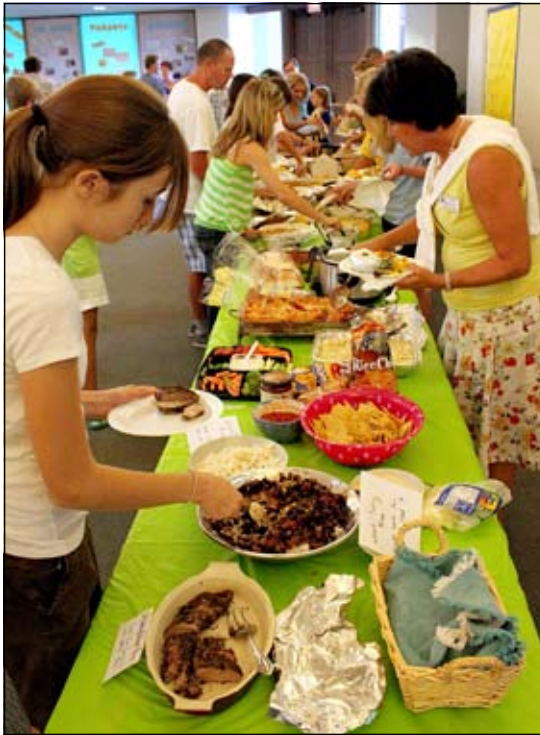
Youth and their families enjoy a delicious selection of dishes during the kickoff potluck dinner.