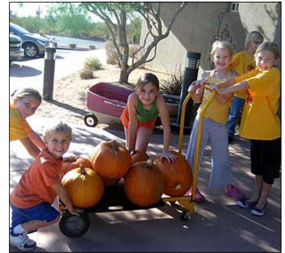
Everyone helps unload last year's pumpkins.

The truck will arrive at noon and we need families, young and old, that are interested in helping unload over 1,000 pumpkins varying in size from itty-bitty to extra-large!