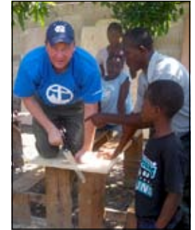
Mac saws a board in Leogone for a school cabinet.