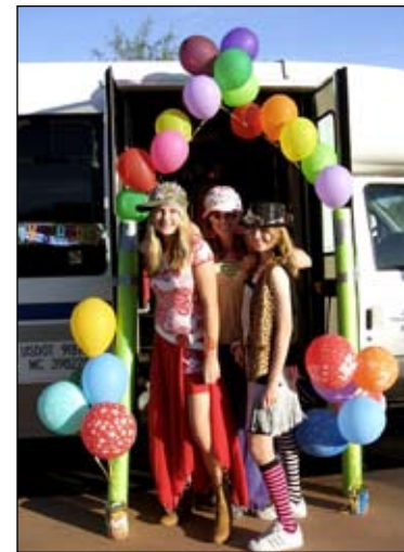
Youth at last year's "Tacky Prom."